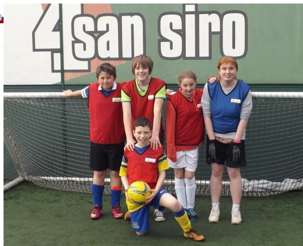
Under 16s Team

Deaf com 18's male team reached the final at their first attempt of a tournament after some hard matches in the preliminary rounds