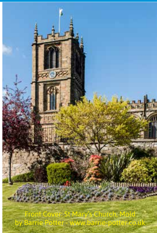
Front Cover: St Mary's Church, Mold by Barrie Potter - www.barrie-potter.co.uk