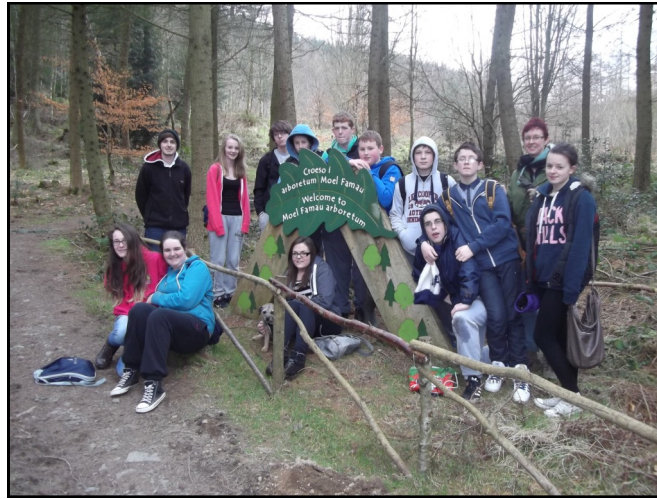
Holywell High students helping with a conservation project in the arboretum on Moel Famau