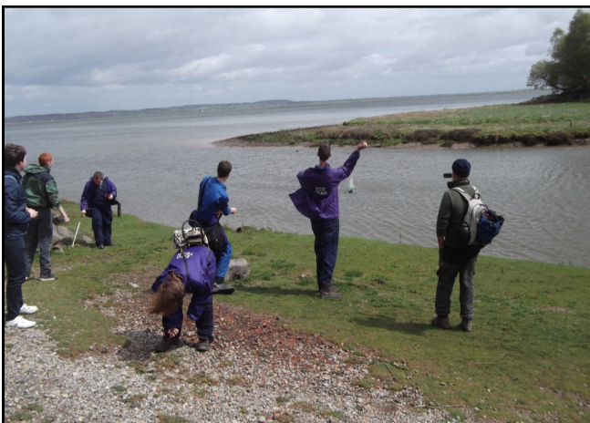
Ysgol Maes Hyfryd students discovering Flint Castle and skimming stones on the estuary