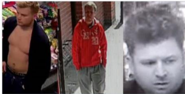
Caught on Camera: Can you help North Wales Police trace these peo... Officers would like to speak to these three men in relation to incidents across North Wales

Can you help North Wales Police trace these people?