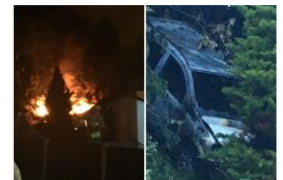
Stolen car explodes into fireball in Bagillt

Stolen car explodes into fireball in Bagillt 2 men have been arrested after allegedly crashing a stolen car which then exploded recently. Neighbours were woken just before 02.00 hours in the morning in Broadacre Close in Bagillt after the vehicle smashed into a wall & burst into flames. Two men from Connahs Quay aged 22 & 25 years were arrested on suspicion of aggravated taking of a vehicle without consent and drink driving. If you have any information that could assist please call