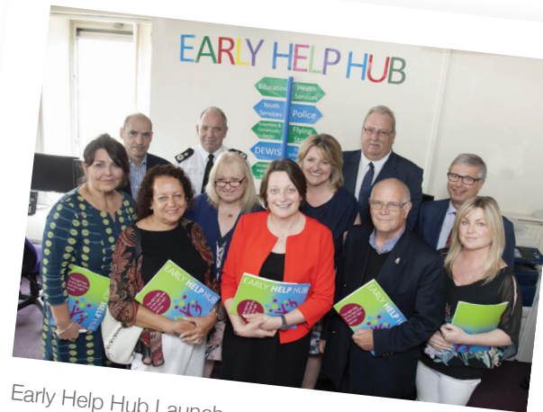
Early Help Hub Launch

Through representation on public sector governance structures, or the facilitation of the nomination and engagement of an appropriate representative from the third sector, bringing challenge, representation and accountability to the public sectors local, regional and national structures.