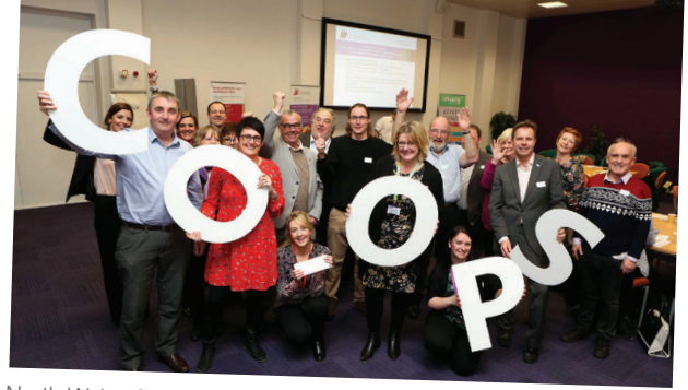
North Wales Social Co-operation Forum

“FLVC was instrumental in helping us successfully obtain funding from the Peoples Health Trust which has allowed us to grow our staff team and increase the services and activities.”