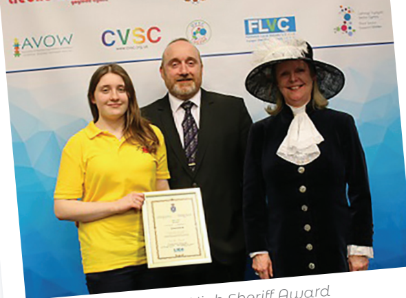
Daffodils receive their High Sheriff Award