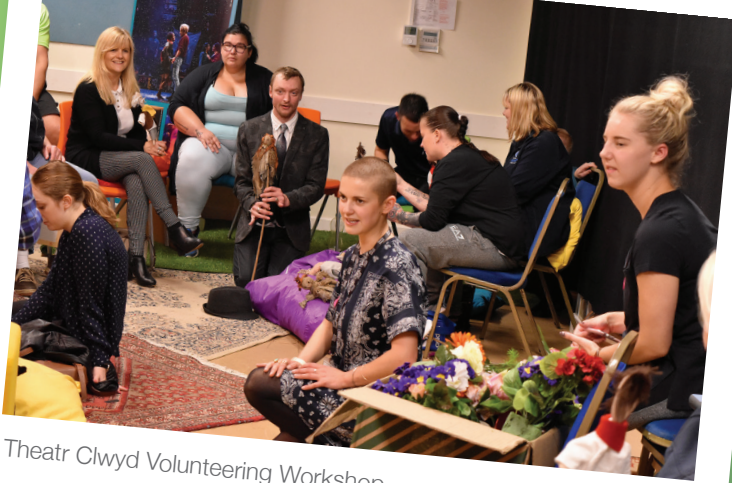
Theatr Clwyd Volunteering Workshop