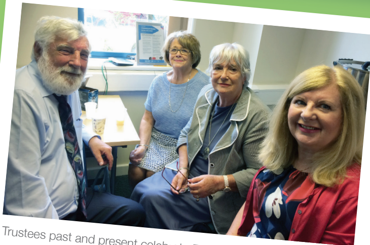
Trustees past and present celebrate FLVC'S 20th Birthday