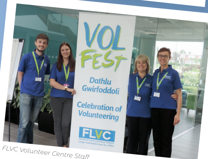
FLVC Volunteer Centre Staff