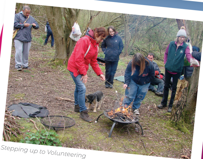
Stepping up to Volunteering