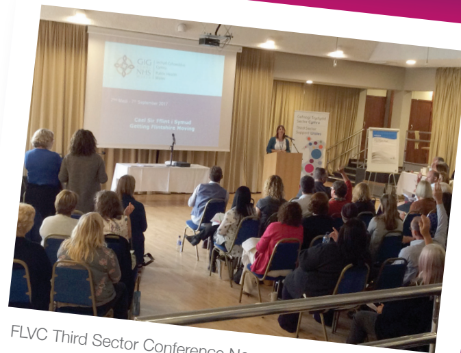
FLVC Third Sector Conference November 2017