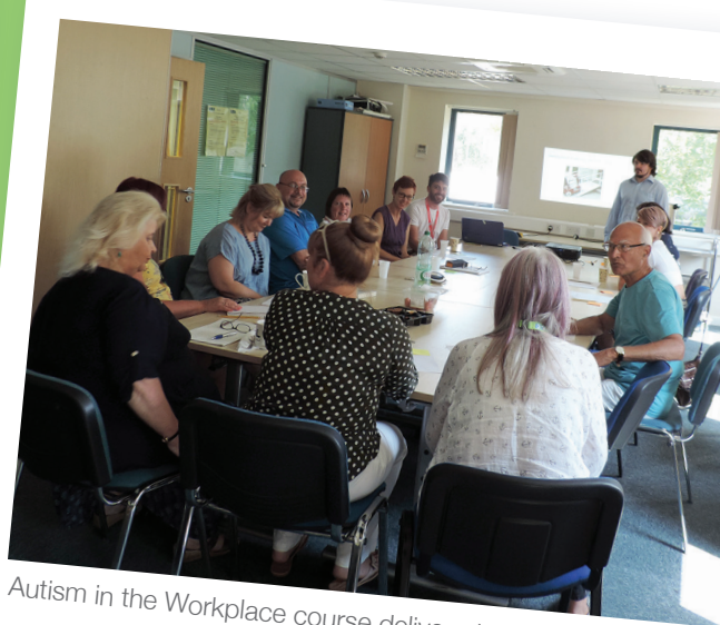
Autism in the Workplace course delivered at Corlan