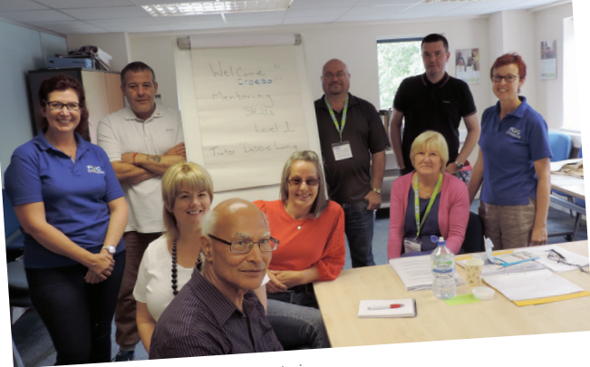
FLVC Volunteer Mentor Training