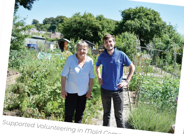
Supported Volunteering in Mold Community Garden