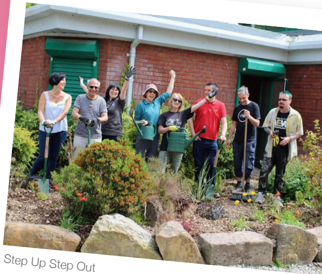
Step Up Step Out