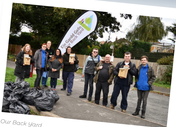
Our Back Yard