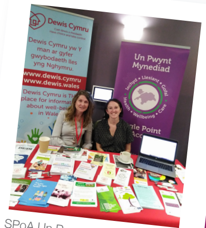
SPoA Un Pwynt Mynediad