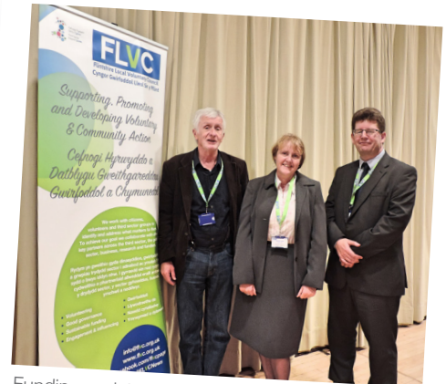
Funding and Governance Team