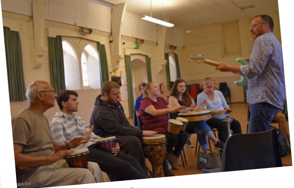
Emerge Community Arts