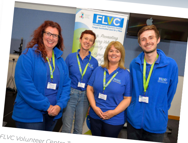
FLVC Volunteer Centre Team