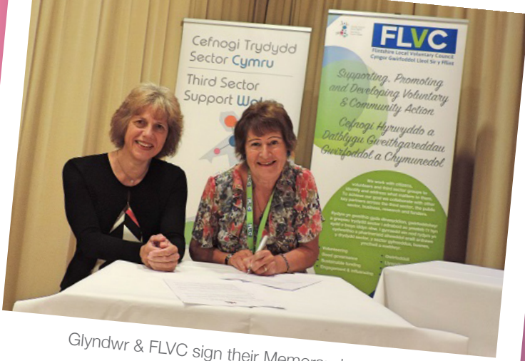
Glyndwr & FLVC sign their Memorandum of Understanding