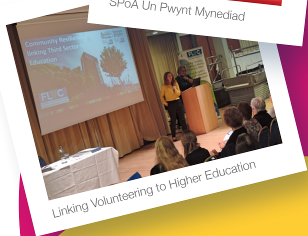
Linking Volunteering to Higher Education

We provide regular information about local, regional and national policy developments and other items of interest through the general FLVC e-bulletin and the North East Wales Wellbeing Daily Digest. Please contact us if you would like to receive these e-bulletins.