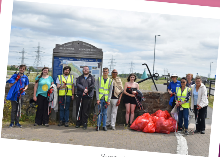
Supported Volunteering with FLVC