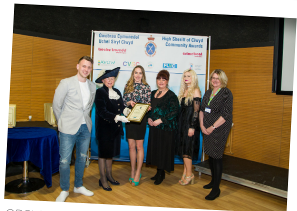
ODEL involve - Receive their High Sheriff Award

“ It’s great to see that there are more people volunteering and engaging in community activities each year in Flintshire. It’s inspiring to see the willingness of people to help others. Being a small part of this is truly humbling. ”