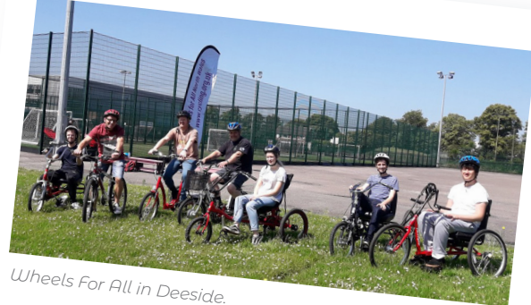
Wheels For All in Deeside.

We help to raise the profile of the achievement of individual volunteers and their collective contribution to the well-being and cohesion of Wales.