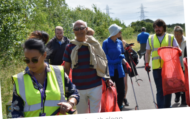
Volunteers keeping coastal path clean